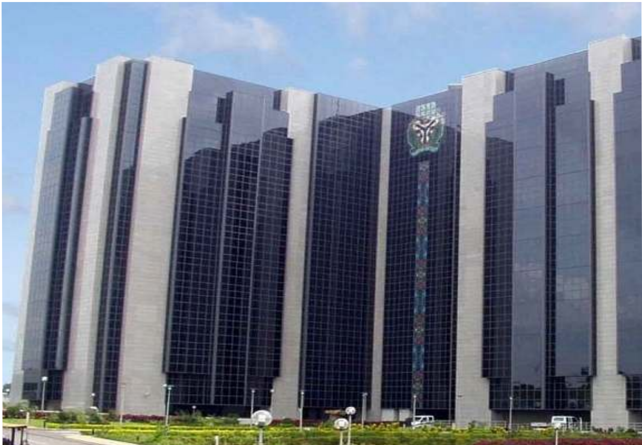
Central Bank of Nigeria, Headquarters

The circular further stated that, cessation of RT200 rebate scheme and the Naira4Dollar remittance scheme, shall take effect from June 30, 2023. All market participants and the public are kindly enjoined to abide by these rules. ■